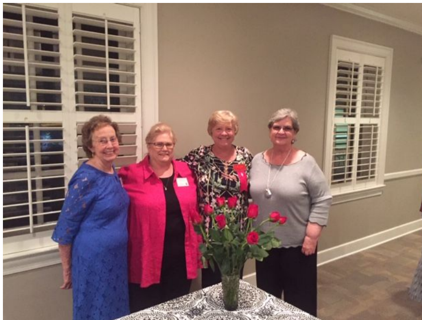
2018-2020 Officer Installation