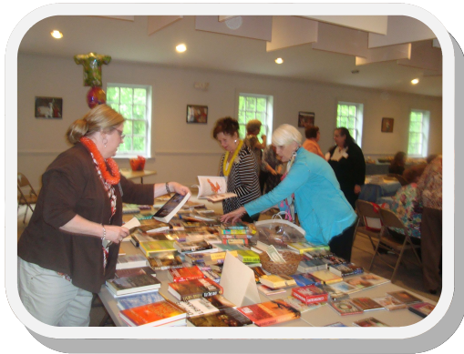
World Fellowship DVD and Book Sale