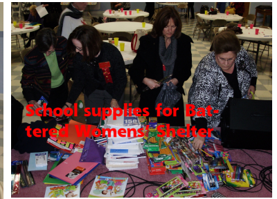
School supplies for Battered Womens' Shelter