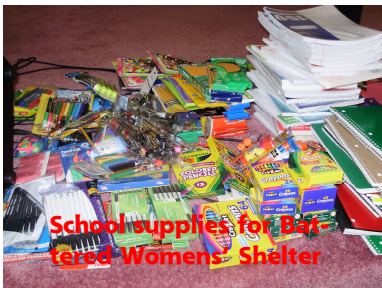
School supplies for Battered Womens' Shelter