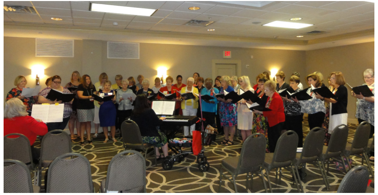
2017 Convention Chorus

and performance. While the convention chorus may not have enough time in our brief, frenetic rehearsals to synchronize our beats, I assure you that you all have found your way into my heart all the same. I so appreciate your attitude, your cheerfulness, and your willingness to work and sing year after year - I am writing this the day after I got home from convention and I am bone tired, but happy for the experience. It has been my joy!