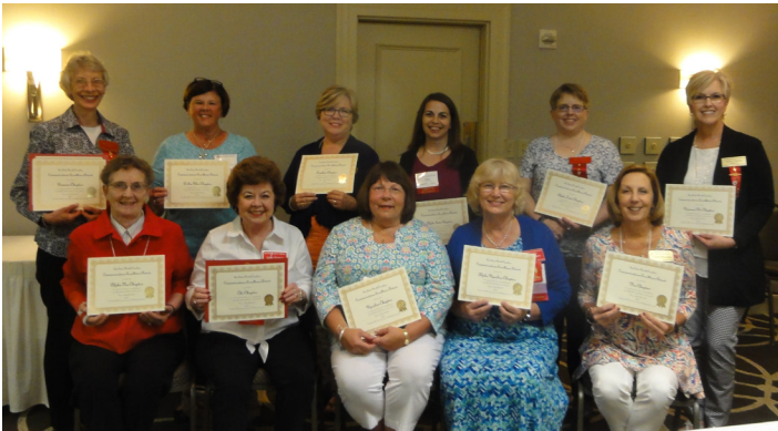
Eleven Chapters qualified for the 2017 Communications Award

Region XI – Newsletter - Alpha Lambda and Alpha Phi Website – Alpha Lambda, Alpha Phi, and Gamma Upsilon