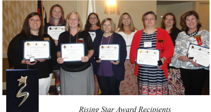
Rising Star Award Recipients