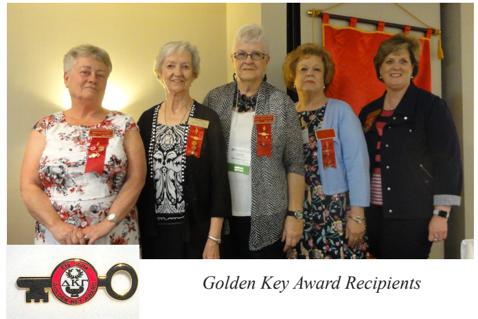
Golden Key Award Recipients