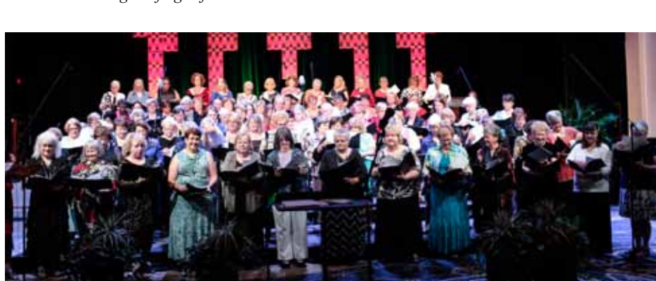
2016 International Convention Chorus