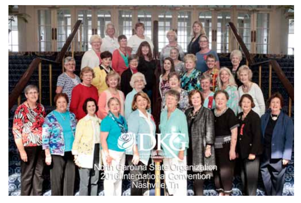
Forty one members of Eta State NC attended the International Convention for one or more days. The Gaylord Opryland is a fun venue for convention gatherings!