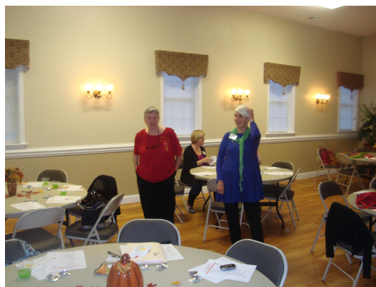
Social Hour prior to the meeting and meal is always enjoyed by all.