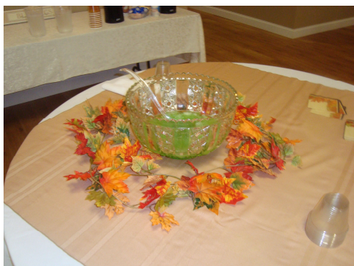
October brings out the beautiful colors and a new Alpha Delta year.