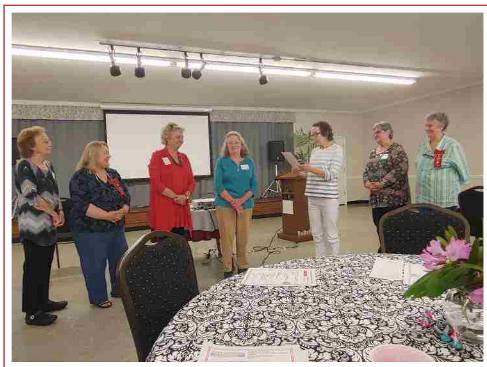
Installation of Officers by W. Pasour Submitted by C. Massengale