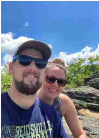
Buffalo Mountain Natural Preserve is a beautiful adventure in Floyd, VA! ~3 mile hike up and back!