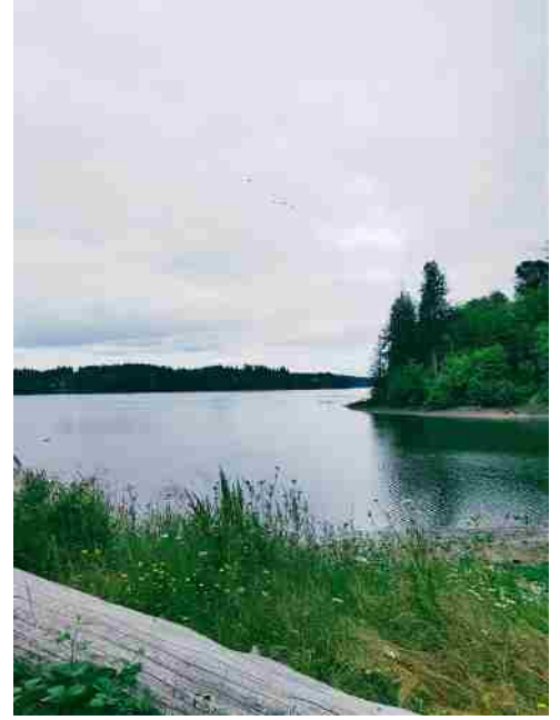
Primordial vegetation along the path to Woodard Bay Conservation Area in Olympia, Washington