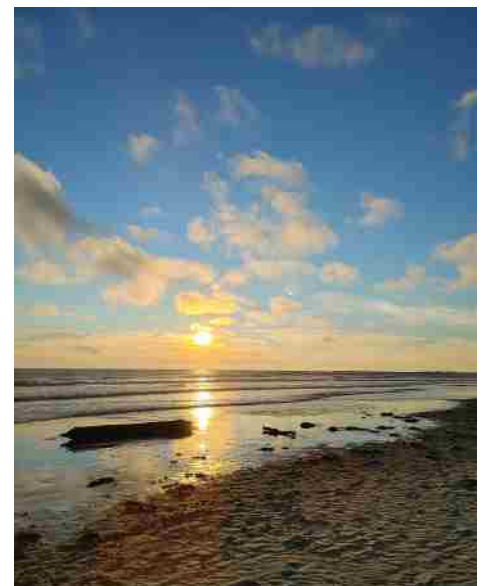
Sunset in Westport, WA

Painted headboard in McMenamins Anderson School Hotel. Each room has a theme unique to someone connected to the old school.