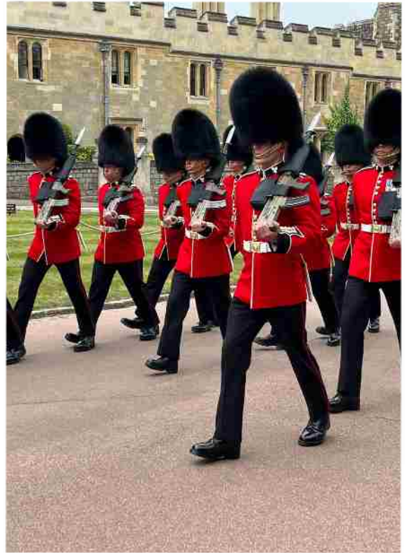
Changing of the Guard at Windsor Castle