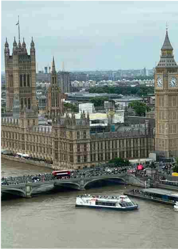
View of Parliament from the London Eye