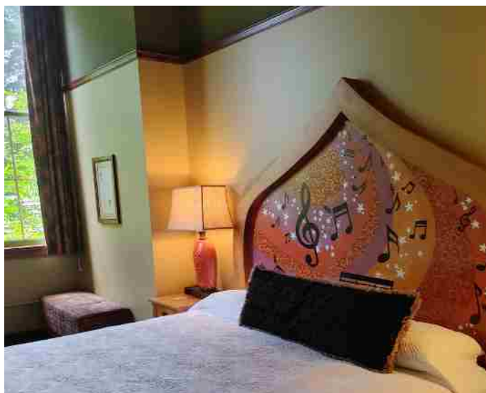
McMenamin resorts utilize historically significant buildings in WA and OR, so interesting!

Painted headboard in McMenamins Anderson School Hotel. Each room has a theme unique to someone connected to the old school.