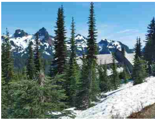
Mt. Rainier in July with 3 feet of snow pack!