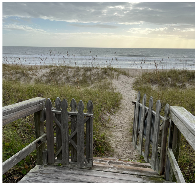
Carolina Beach--where my family gathered!

NC DKG: "Linking the Past, Present and Future"