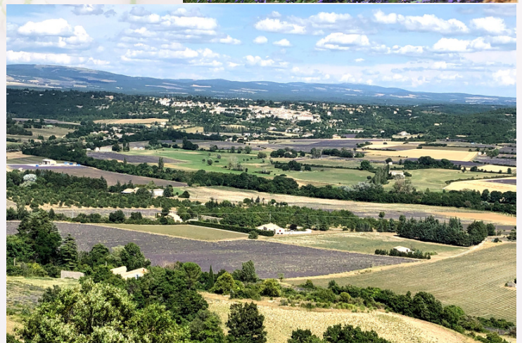
Lavender and the French countryside Submitted by D. Crumpton